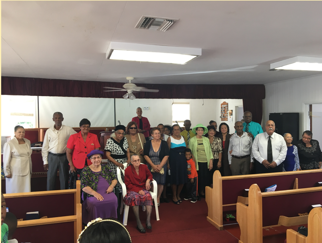
Celebrating our Seniors during Older Person's Month - October