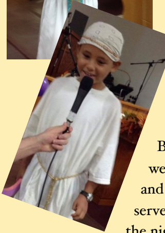
Old Fashioned Night, October 31 - children and adults dressed up as Bible characters. Prizes were given to contestants and refreshments were served at the conclusion of the night.