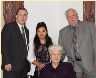
Revival with the Thompsons - November 15-20

Both church locations are now wheelchair accessible.