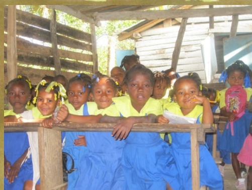
Children at Dos Palais benefit from the Foodbank.

Operation World: A great prayer resource