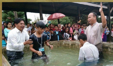
During last year's Gospel Camp, 25 people were baptized, including 21 converts from Buddhism!