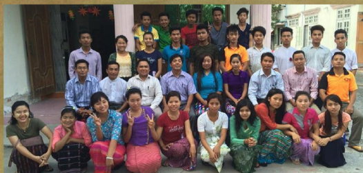
Shiloh Bible College students