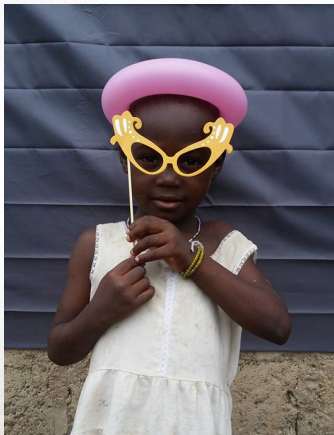
Photo booth fun in Gberi