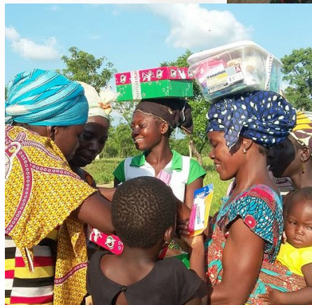
We were able to pass out Samaritan's Purse shoe- boxes to kids in Gberi.