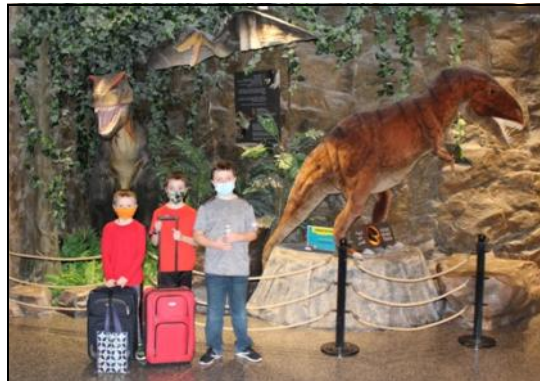
Some of the wildlife at the Doha airport.