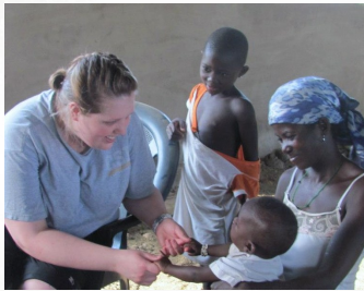
Please pray for me as I make plans to move to Ghana.