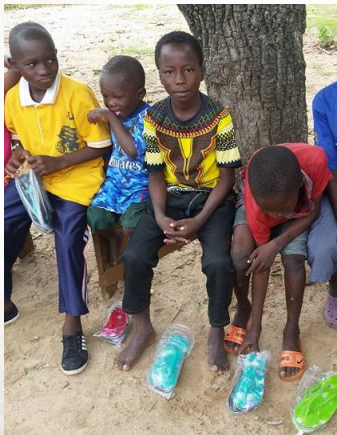
We were given some money for shoes. Through that donation we were able to buy 220 flip flops for the village of Ducie.