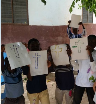
Hanging out with some neighborhood kids