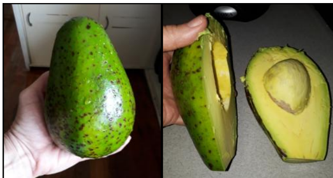
On furlough we missed “real” avocados.

Translation work is currently awaiting the ability to travel and re-connect with the team. Thankfully one of the team members now has access to Facebook, so we can communicate as much as he is able through Messenger. The COVID restrictions are such that we are just now being allowed to travel between provinces, but with severe restrictions, such as isolation for the whole family both before and after each trip, even if only one person is travelling. (continued on Back Page)