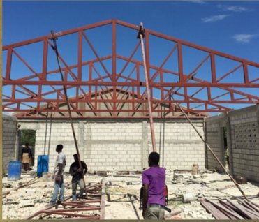
Roof construction at Fond Parisien