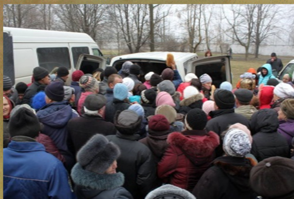
Food distribution draws a crowd.