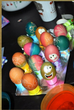
Easter eggs decorated in Asia in 2013