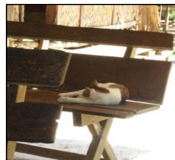
A sunny Sunday morning.

During the hustle and bustle of the season, we pray that each one of you will be able to grasp anew the awesome story of Jesus' birth.