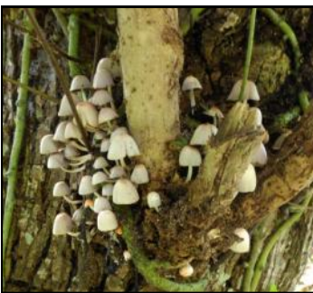
A “Christmas village” grew on a dead tree out back.