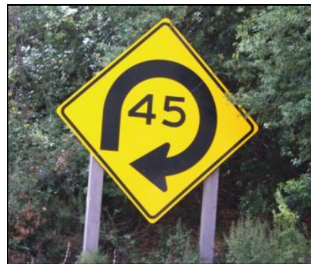
This sign reflects how life feels sometimes!

At this point we are hoping to go back to Papua New Guinea in January. That's approaching rapidly, but we're trusting that it will happen in God's timing.